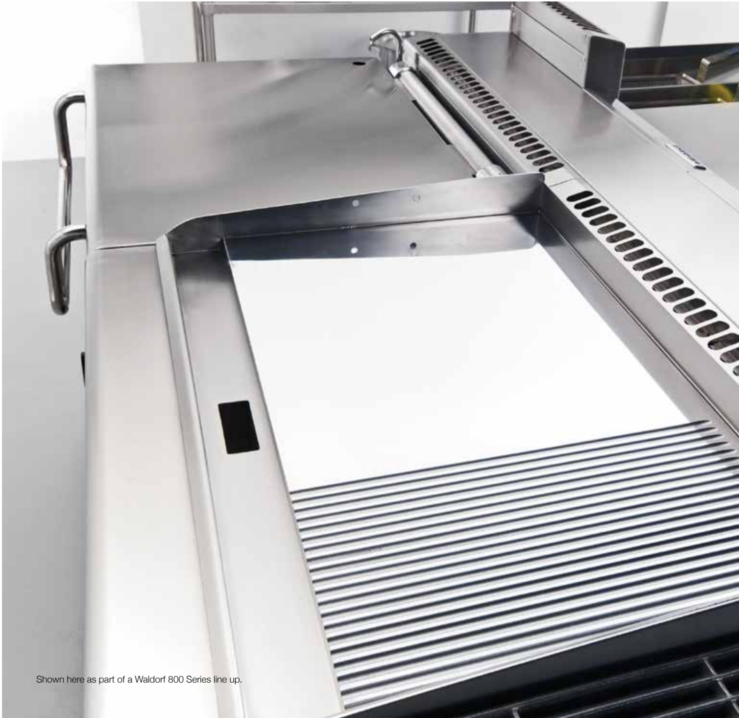
Shown here as part of a Waldorf 800 Series line up.